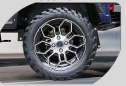
Silent Tire with Off-road Thread