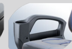
Rear Armrest With Built-in Storage Compartment