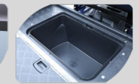
Rear Storage Compartment