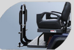
Rear Handrail with Optional Towing Hitch Receiver