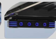
Cuboid Evolution Sound Bar