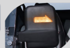
Powered Rear View Mirrors