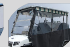
Optional All-Weather Enclosure