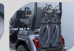
Optional Golf Bag Holder