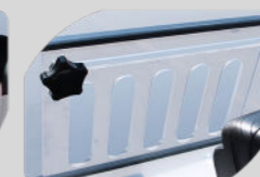
Slideable Air Vents