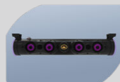
Cylindrical Evolution Sound Bar