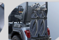
Optional Golf Bag Holder