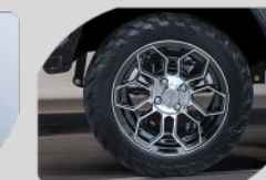
Silent Tire with Off-road Thread