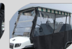
Optional All-Weather Enclosure