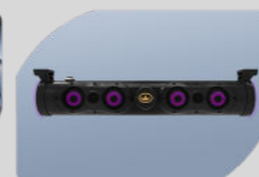
Cylindrical Evolution Sound Bar